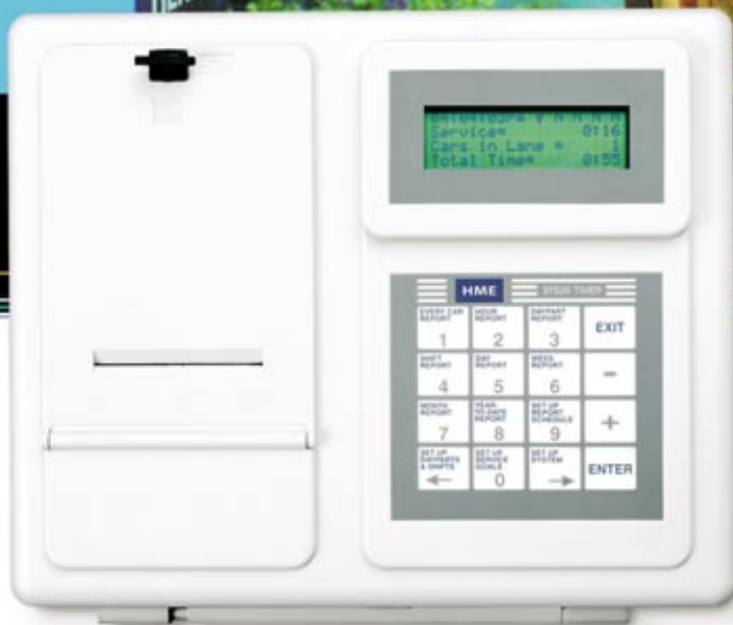
HME System 30A Drive-Thru Timer